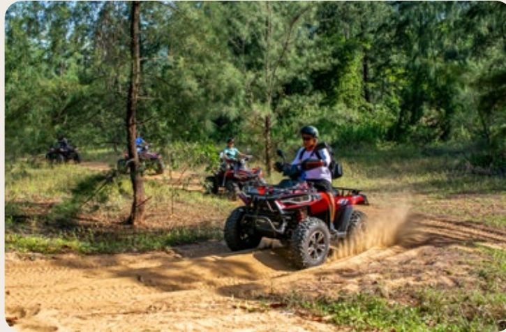
ATV Ride / Off-Road Driving