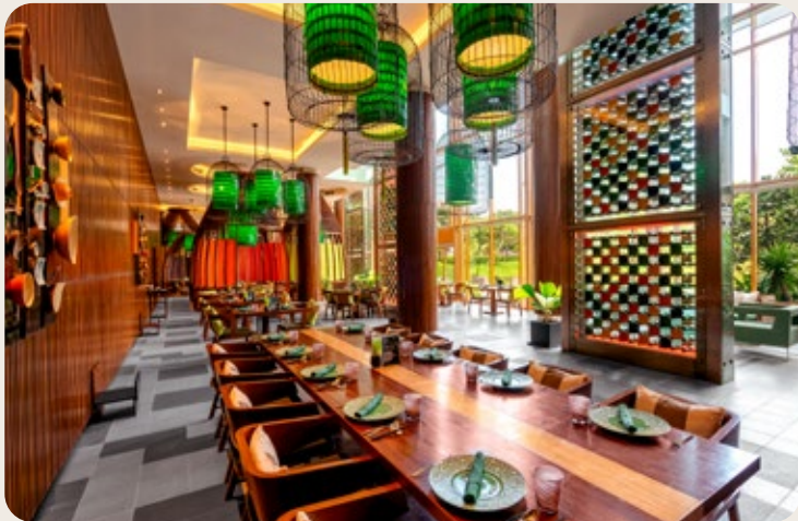
Rice Bowl - Southeast Asian Cuisine