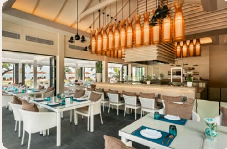
Azura - Mediterranean Cuisine