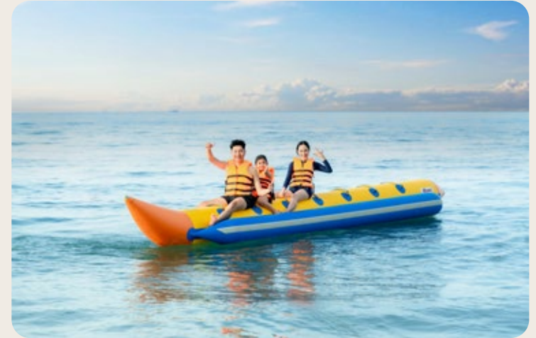
Banana Boat Ride