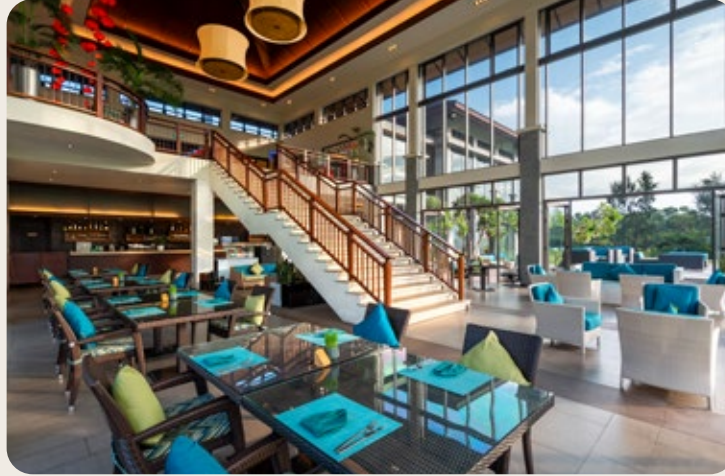
Golf Café Restaurant