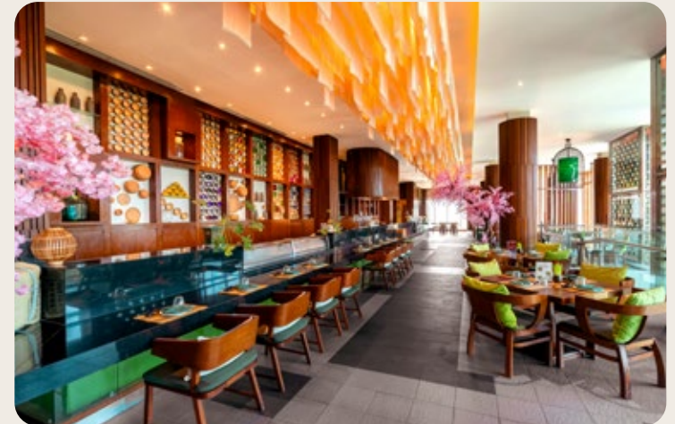
Rice Bar - Japanese Cuisine