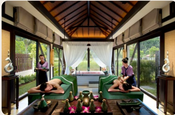
Banyan Tree Spa