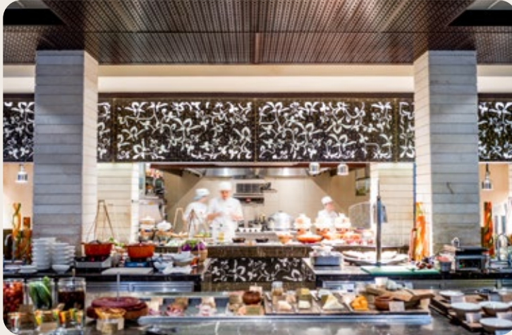
Water Court - Vietnamese Cuisine Breakfast