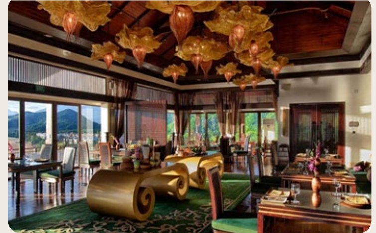
Saffron - Thai Cuisine