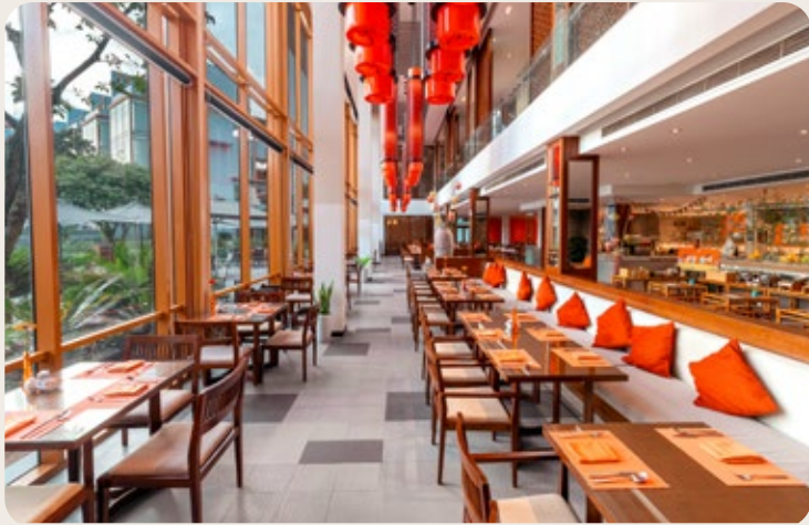
Market Place - Breakfast