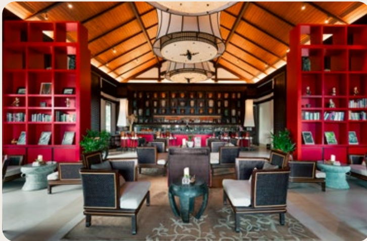
Thu Quan Lounge