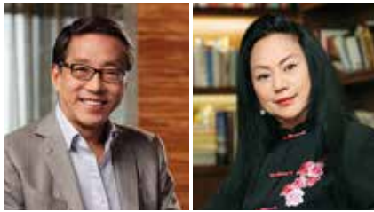
Mr Kwon Ping

Banyan Tree Houldings Limited Executive Chairman